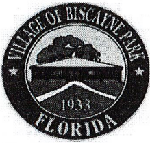
Exhibit A Village of Biscayne Park MASTER FEE SCHEDULE