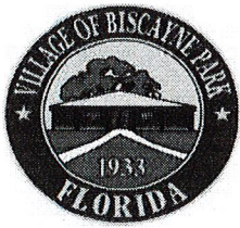
Exhibit A Village of Biscayne Park MASTER FEE SCHEDULE