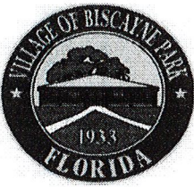
Exhibit A Village of Biscayne Park MASTER FEE SCHEDULE