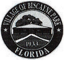
Exhibit A Village of Biscayne Park MASTER FEE SCHEDULE