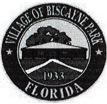
Exhibit A Village of Biscayne Park MASTER FEE SCHEDULE